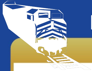
Chart 1: Composite Transport Index