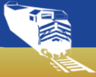
Chart 1: Composite Transport Index