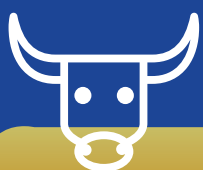
Table 1: Number of livestock marketed ('000)